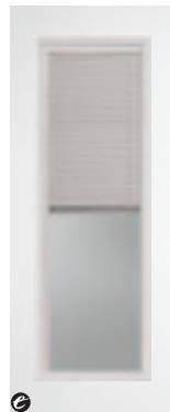
DRS00 687RLB (FOR 2/6 DOORS)