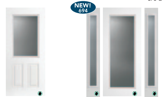
DRS40 684SGSG DRS00 686SGSG SLS00 694SGSG