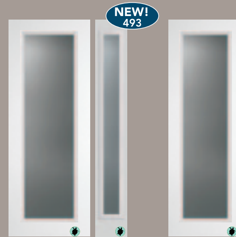
DRS0080 612SGSG SLS0080 493SGSG DRS0080 496SGSG