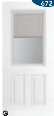
DRS40 684RLB/672RLB (672 NEW FOR 2/6 DOORS)